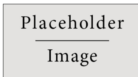
Figure 3.1: Figure caption

Referencing Figure 3.1 in-text automatically.